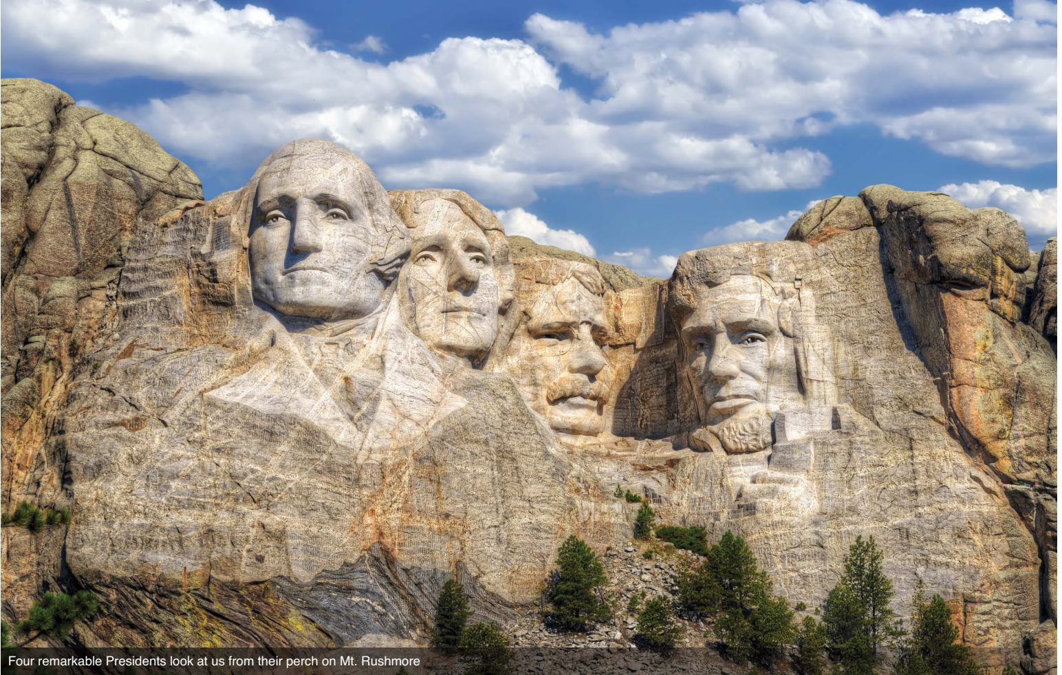
Four remarkable Presidents look at us from their perch on Mt. Rushmore