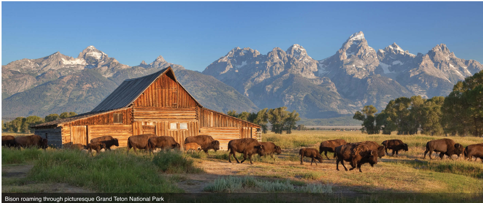
Bison roaming through picturesque Grand Teton National Park