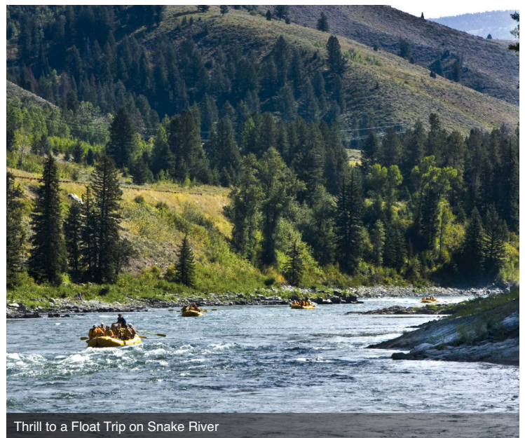
Thrill to a Float Trip on Snake River

After breakfast transfer to the Salt Lake City International Airport for flights home anytime today. (Breakfast)