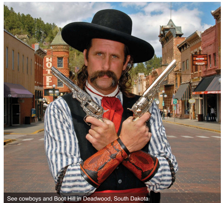
See cowboys and Boot Hill in Deadwood, South Dakota

The town of Deadwood was designated a National Historic Landmark in 1967 and preserves the history and legends of the Wild West from its beginnings as a mining town. Our brief tour of the town takes us along the same streets walked by Wild Bill